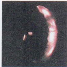
Fig. 2 (a) Glowing firebrand, d_0 = 25 mm (b) Glowing firebrand, d_0 = 50 mm.

Table 2 displays the results for single flaming firebrand impact onto pine needle beds. To produce flaming firebrands, the firebrands were ignited and then allowed to free burn for 30 s prior to release into the samples. The acronym FI denotes flaming ignition. From these tables, under all conditions considered, it was possible to produce flaming ignition for single firebrand impact when the firebrands were released in a flaming state onto pine needle beds. These results suggest that if the firebrands are in flaming mode, only a single firebrand is required to begin an ignition event for these materials. The ignition process due to a single flaming firebrand impacting a pine needle bed is shown in figure 3.