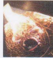
Fig. 3 Single flaming firebrand which produced flaming ignition in a pine needle bed held at 11% moisture, d_0 = 25 mm.